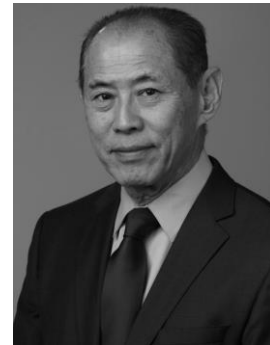
Dale Minami President's Award