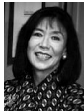
Karen Koramatsu Community Service Award

Tickets may be purchased by emailing us at apabasolanocounty@gmail.com and mailing checks to APABA Solano County, P.O. Box 2854, Fairfield, CA 94533. You may also purchase tickets via PayPal through our website www.apabasolanocounty.com . For more information call (510) 220-7171.